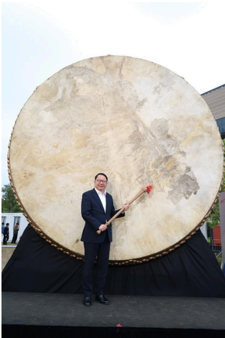
Photo 2: Chief Secretary for Administration, Eric Chan Kwok-ki attended the “One Beat, One World: Connecting Through the Drum” Drum Carnival and 5G Live Concert on 8 December.