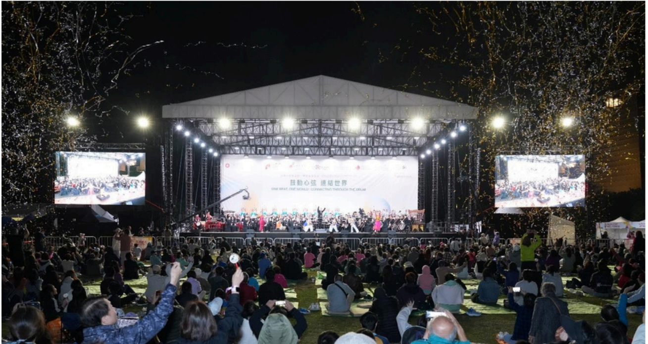
Photo 6: Taking a lead from the Hong Kong Chinese Orchestra, the concert connected the world through the powerful rhythms of drumming. Chinese hand drums were distributed to the audience, amplifying the rhythm and elevating the atmosphere to its peak.