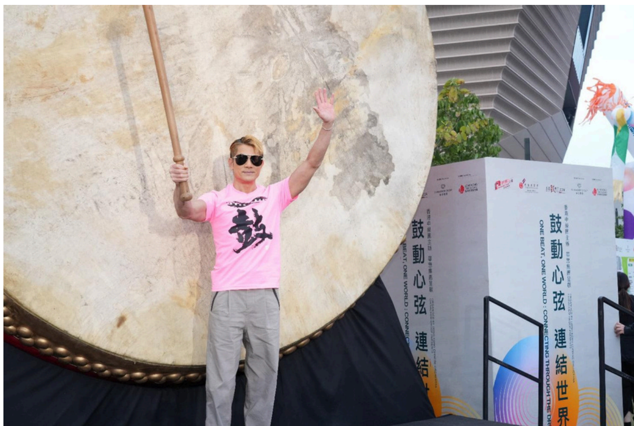
Photo 4: Superstar Aaron Kwok attended as Honorary Ambassador of the Hong Kong Chinese Orchestra Hong Kong Drum Festival, further elevating the event's prestige.