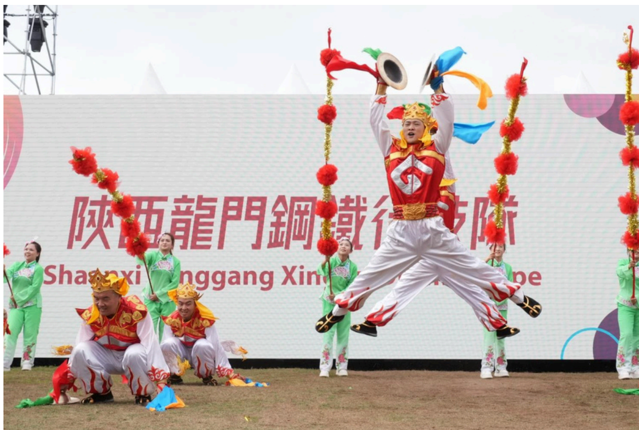
Photo 7: The Drum Carnival, which began at noon, featured a parade by drumming troupes designated as part of China's intangible cultural heritage.

Photo link: https://bit.ly/OneBeatOneWorld_Carnival