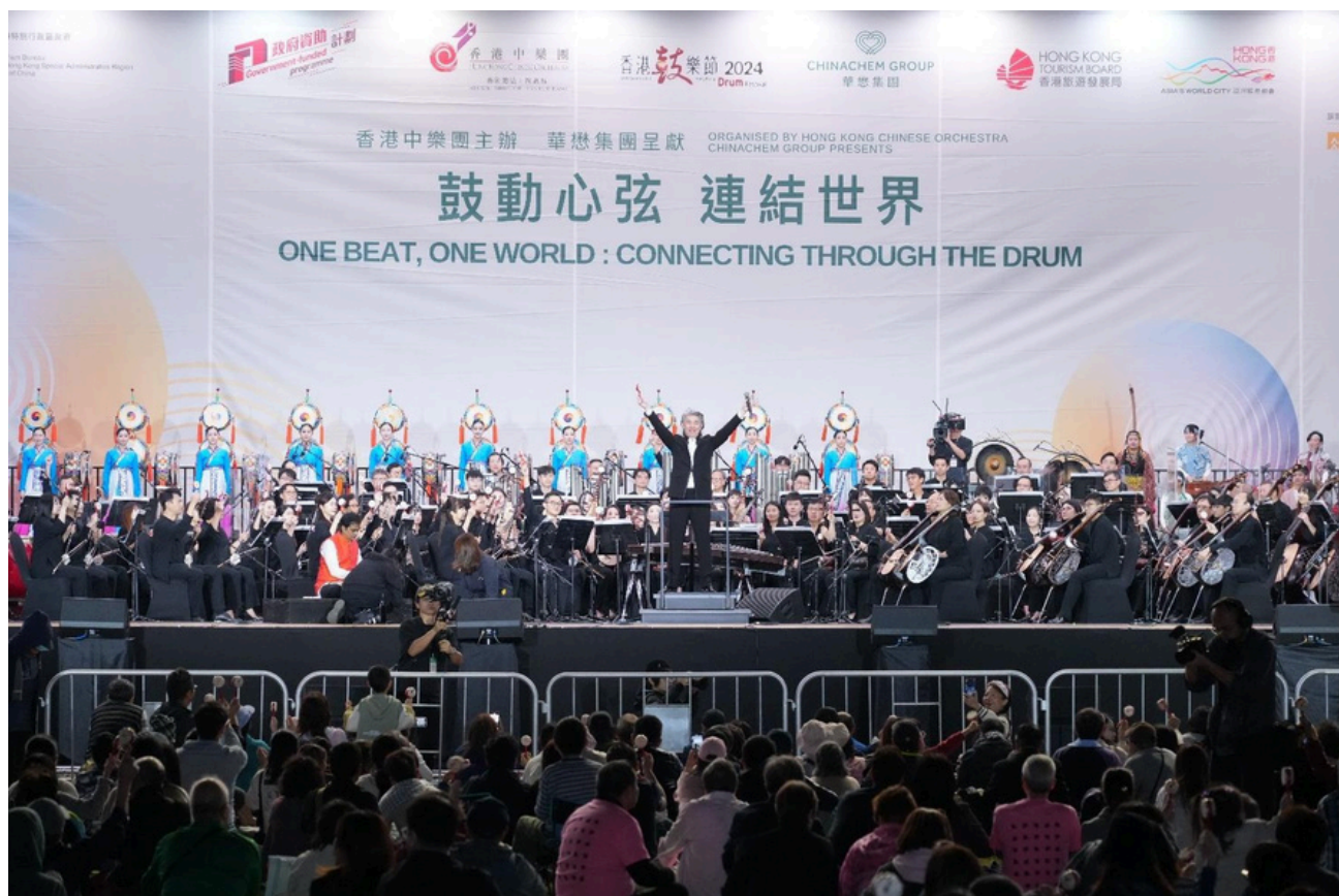
Photo 5: The concert brought together renowned drumming and dance artists from around the world, delivering a spectacular “Drum and Dance” extravaganza.